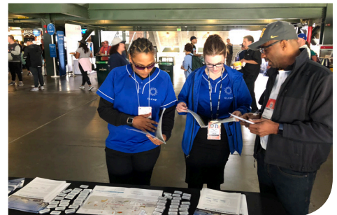
Port of Seattle community outreach