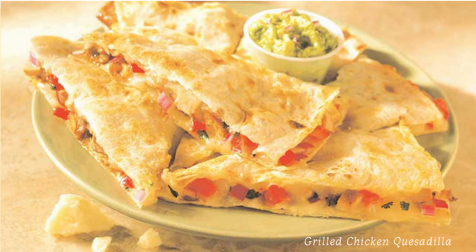
Grilled Chicken Quesadilla