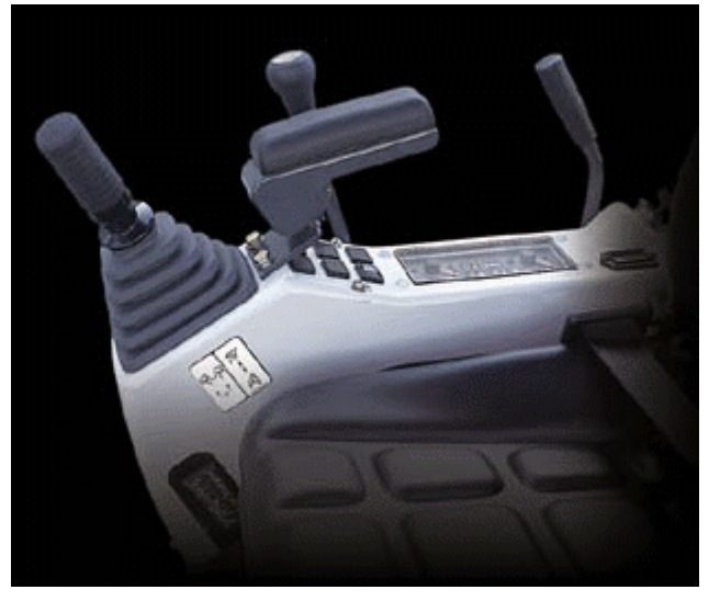
MAIN CONTROL LEVERS: