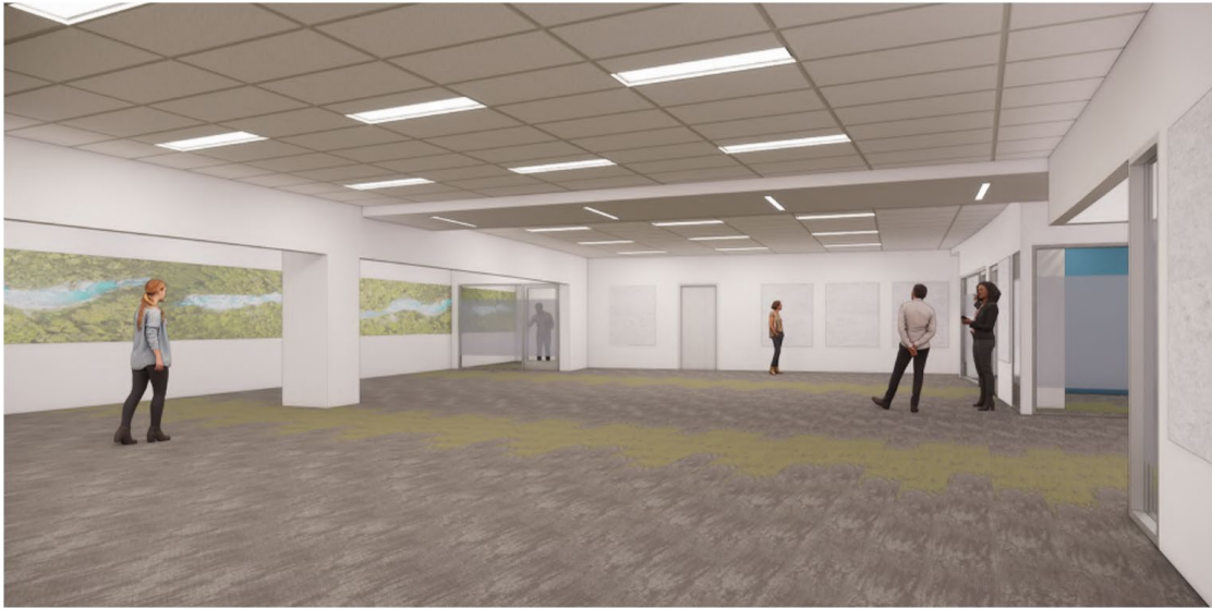
Interior renderings indicating artwork locations (above and below).