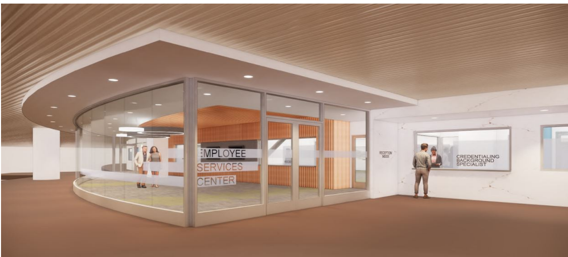
Employee Services Center entry (above).