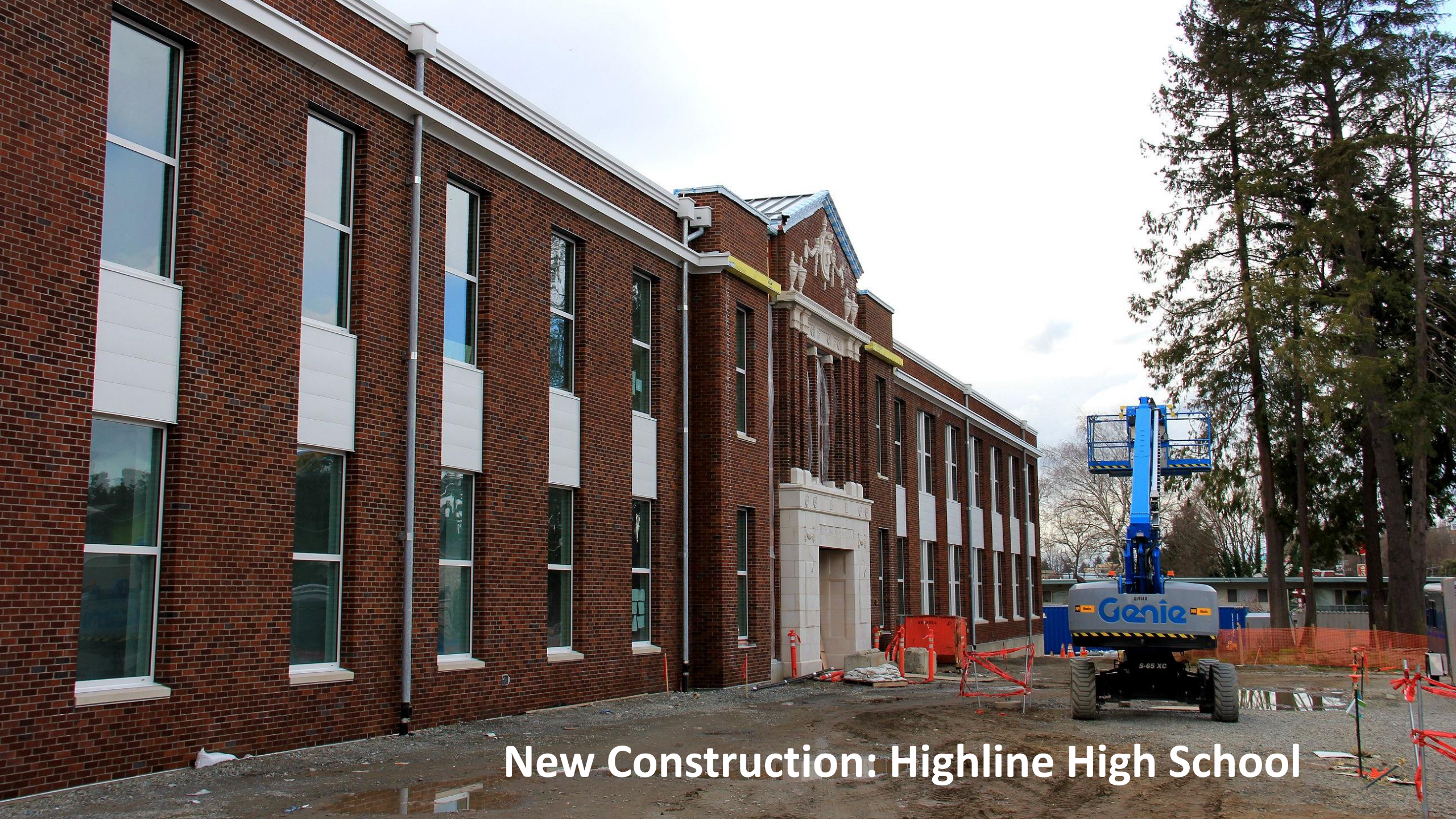
New Construction: Highline High School