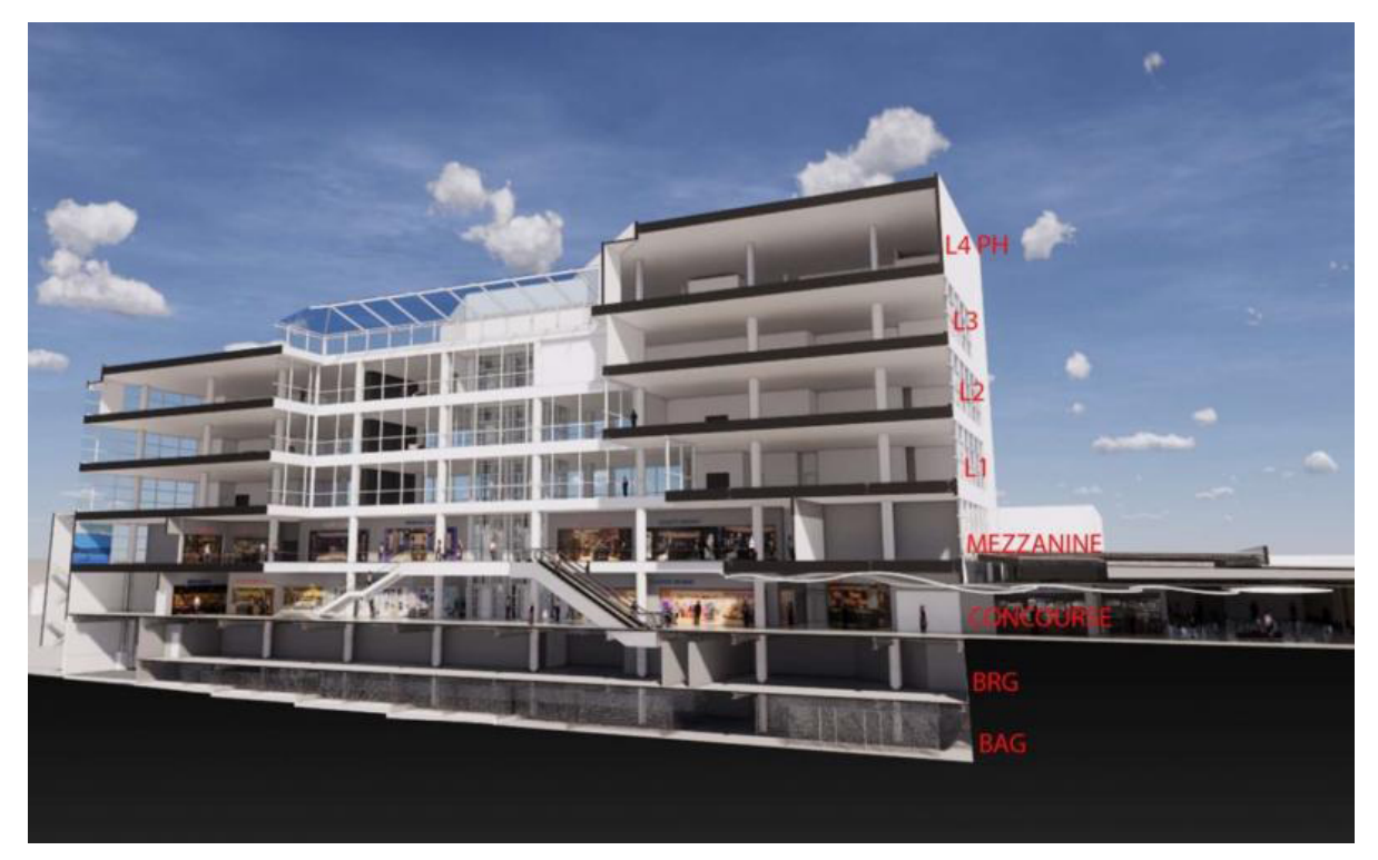
<u>The Miller Hull Partnership</u> and <u>Woods Bagot</u> were recently selected as architects for the design of a $340 million addition to the SEA Airport's C1 Building at the intersection of the C and D concourses. When complete, the planned <u>C1 Building Expansion Project</u> will elevate the passenger experience and add room for customer amenities and office space to the facility. <u>Turner Construction</u> will serve as the general contractor and construction manager on the design-build project.

The expansion will add four stories of 110,000 square feet to the existing 99,000 square foot building, providing travelers more dining and retail options, new airline lounge spaces, amenities such as an Interfaith Prayer and Meditation Room and a Nursing Mothers Room, as well as additional office space for tenants, airlines, and TSA.