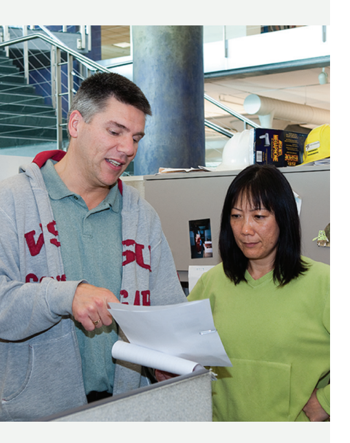
"I like knowing there are places to turn to when I have a question or concern."

Employees should trust their instincts. They should ask questions or raise concerns, rather than ignore behavior that could become a serious problem.