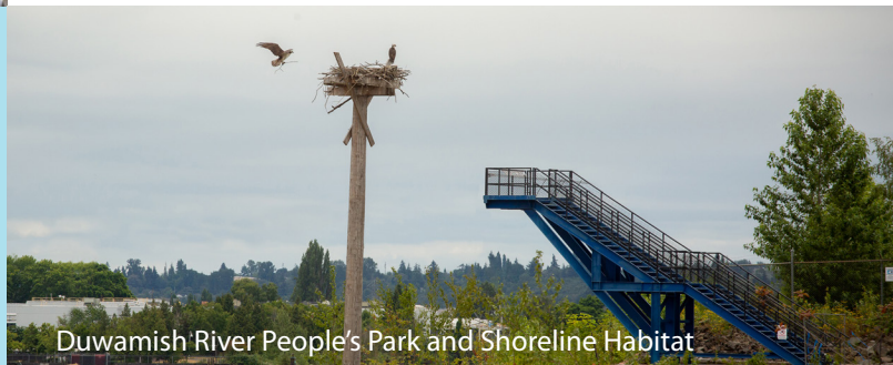
Duwamish River People's Park and Shoreline Habitat