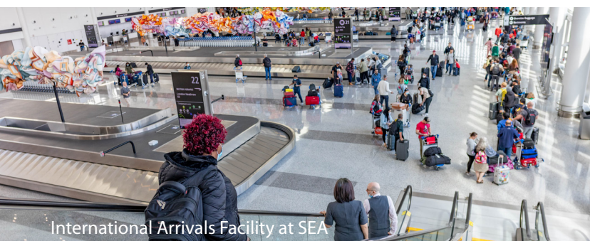
International Arrivals Facility at SEA