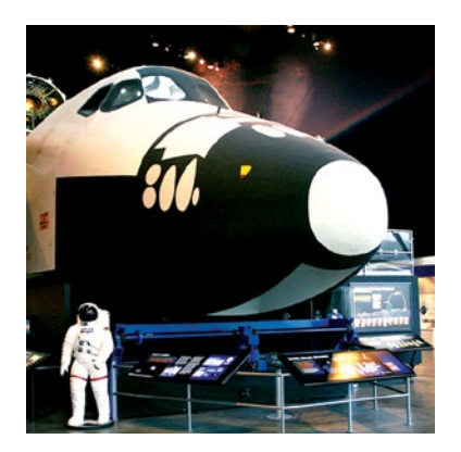
Museum of Flight Travel through Time + Space

Explore a chocolate factory and enjoy all the delicious chocolate samples. This immersive experience educates and inspires visitors to delight in the chocolate-making process.