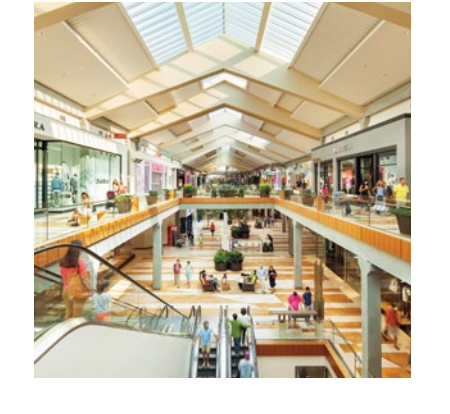
The Bellevue Collection Shop, Eat + Stay

The Bravern has paired the best customer service with the ultimate luxury brands in the world, featuring endless inspiration and style for visitors and global fashion enthusiasts.