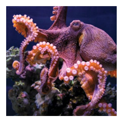
Seattle Aquarium Our Marine Environment

Seattle Aquarium takes head-on the responsibility to protect and restore our marine environment and it all starts with interactive educational inspiring marine displays.