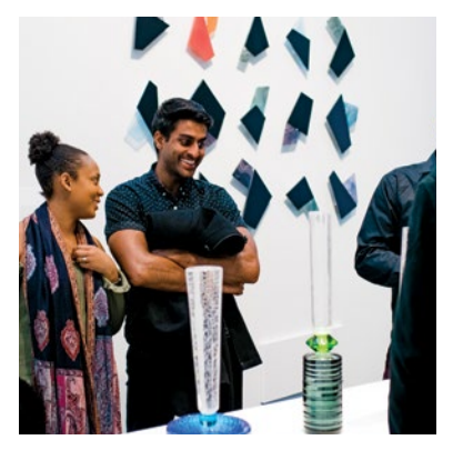
Bellevue Arts Museum Explore Art, Craft + Design

Discover over 200 shops, 50 restaurants and 3 luxury hotels—all in one place. With concierge services, valet parking, and a host of visitor amenities, this is your upscale place to play.