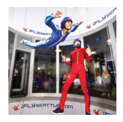
Indoor Skydiving Jump into the Thrill

Experience the sensation of flying in state-of-the-art vertical wind tunnels. iFLY is a family-friendly activity safe for all ages, experience levels, and abilities.