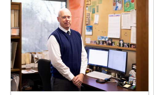
May is National Small Business Month! In honor of Small Business Month, the Diversity in Contracting team caught up with Elcon Associates... Read More