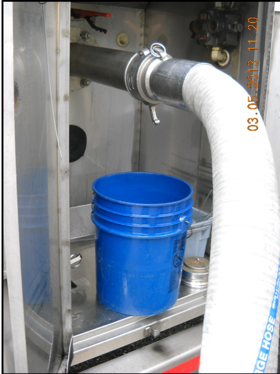
Figure 8. Temporary Containment Device Placed Under a Hose Connection.

The following BMPs or equivalent measures are required in areas of transfer from tanker trucks and railcars to aboveground or underground storage tanks: