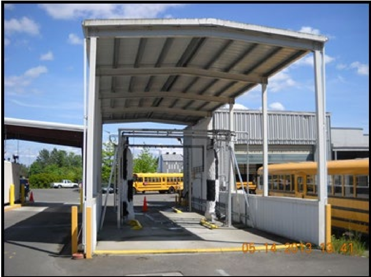
Figure 6. Car Wash Building with Drain to the Sanitary Sewer.