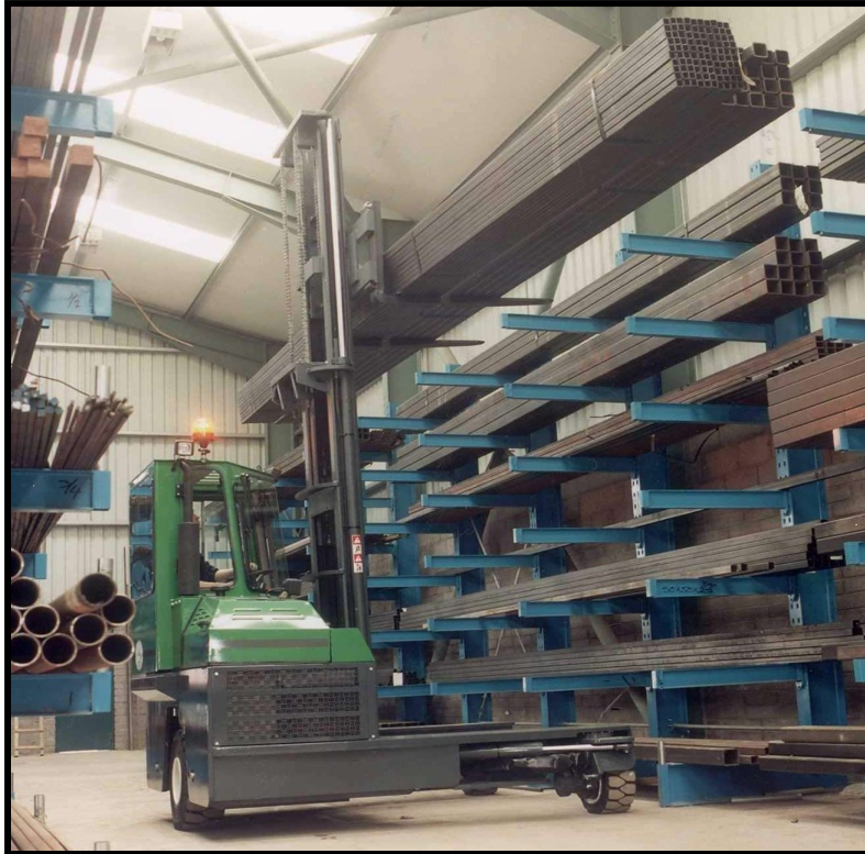
Figure 11. Covered and Secured Storage Area for Bulk Solids.