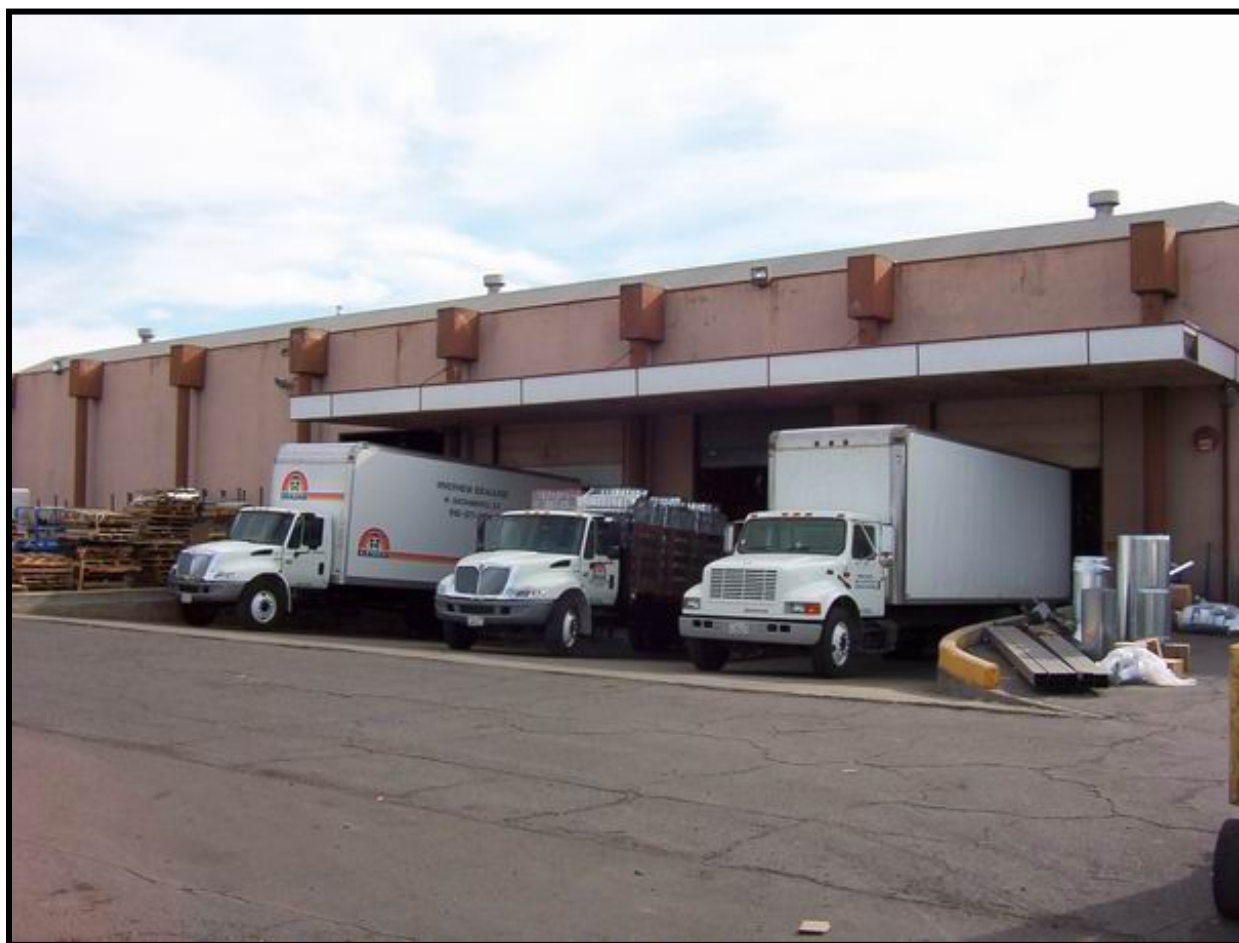
Figure 9. Loading Docks with an Overhang to Prevent Material Contact with Stormwater.