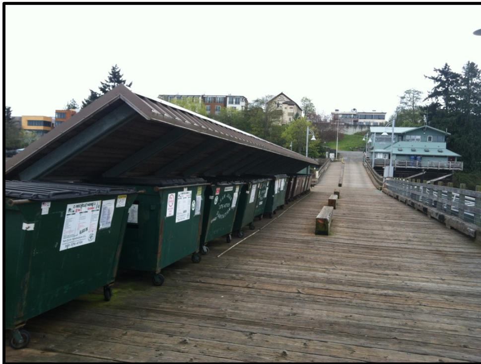
Figure 1. Covered Outdoor Storage of Solid Wastes.