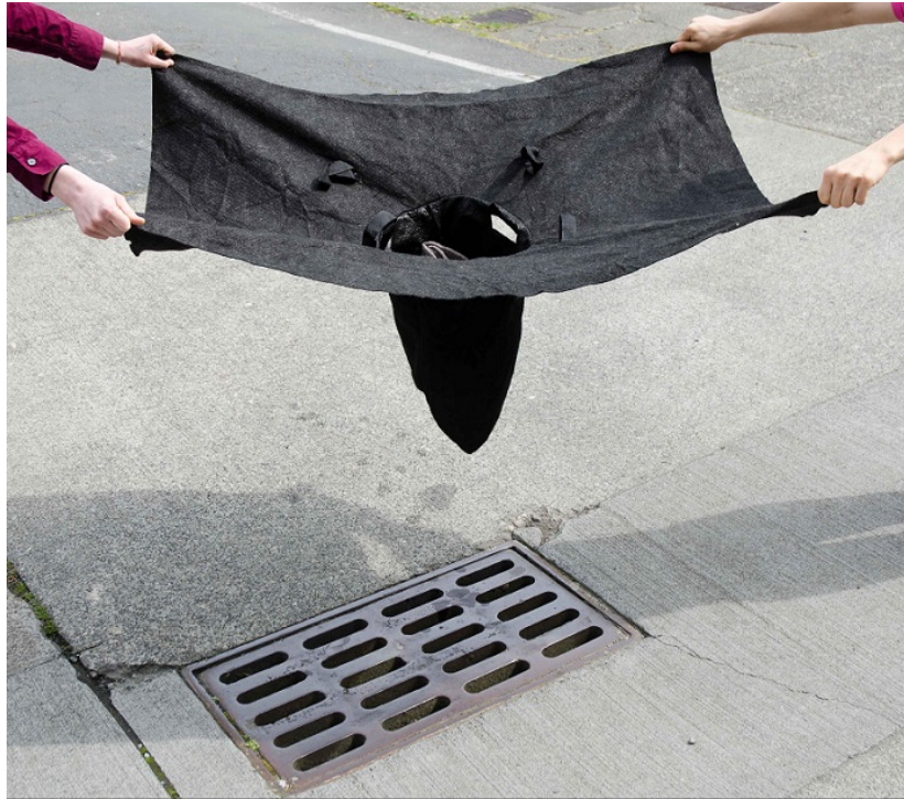
Figure 5. Commercially Available Catch Basin Filter Sock.