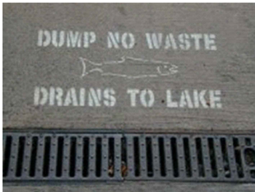
Figure IV-7.6: Storm Drain Inlet Labels