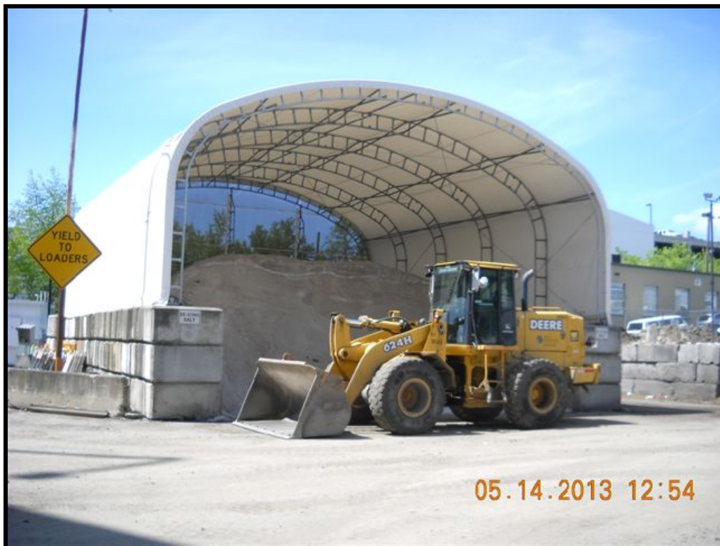
Figure 12. Covered Storage Area for Erodible Material (gravel).