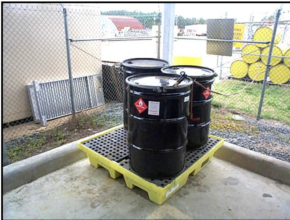
Figure 14. Containers Surrounded by a Berm in an Enclosed Area.