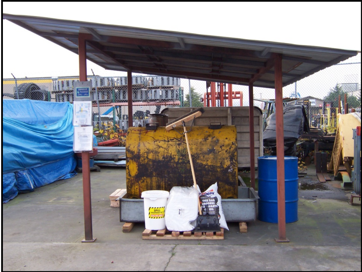
Figure 2. Waste Storage Area with Spill Kit and Posted Spill Plan.