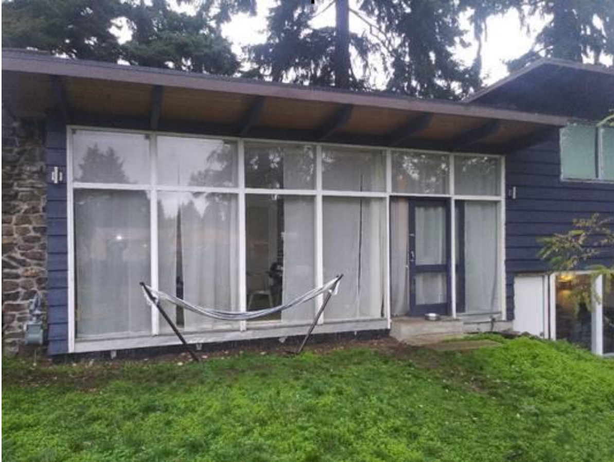
Before window replacement