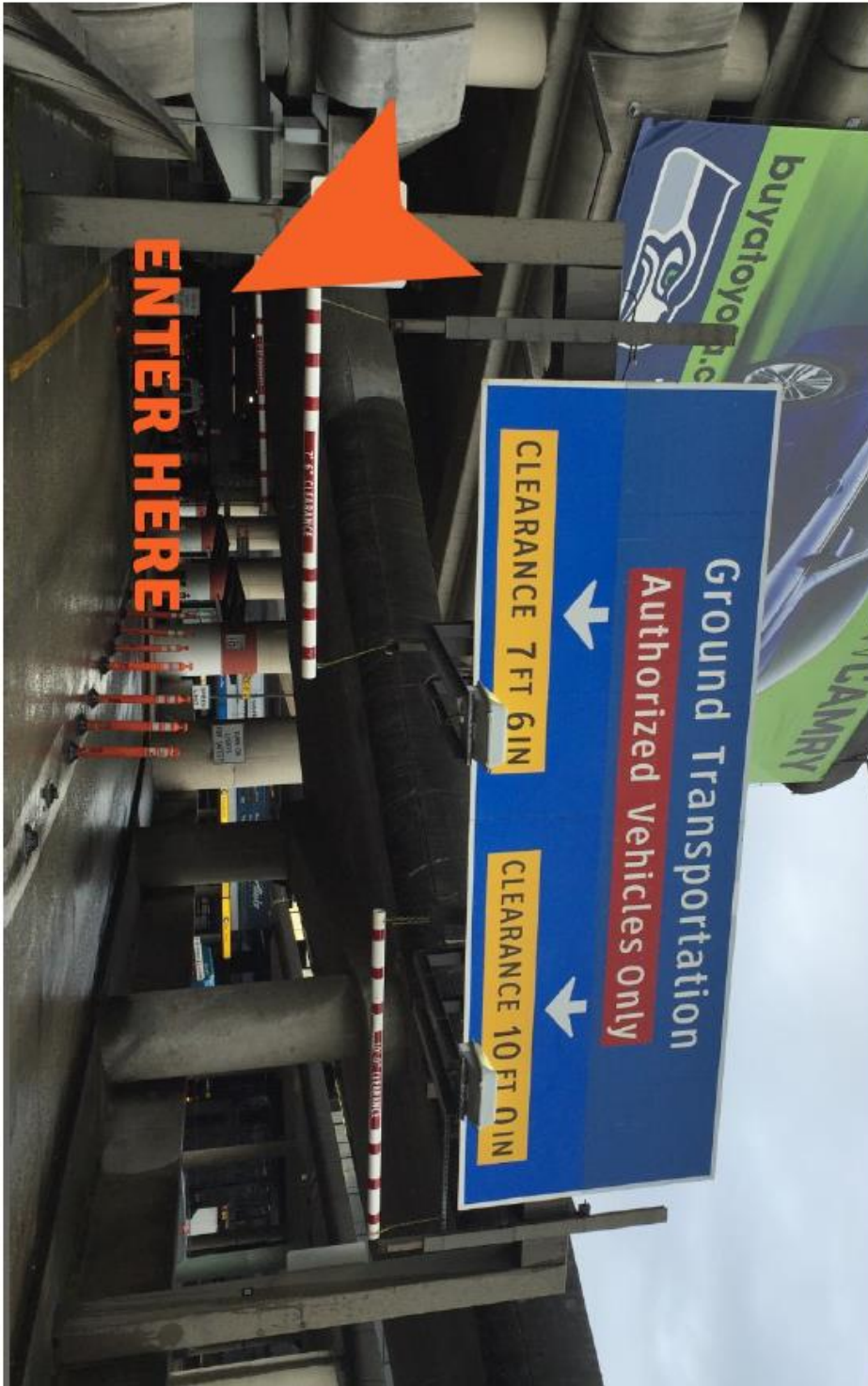
ENTRANCE TO 3RD FLOOR AIRPORT PARKING GARAGE GROUND TRANSPORTATION OPERATING AREA