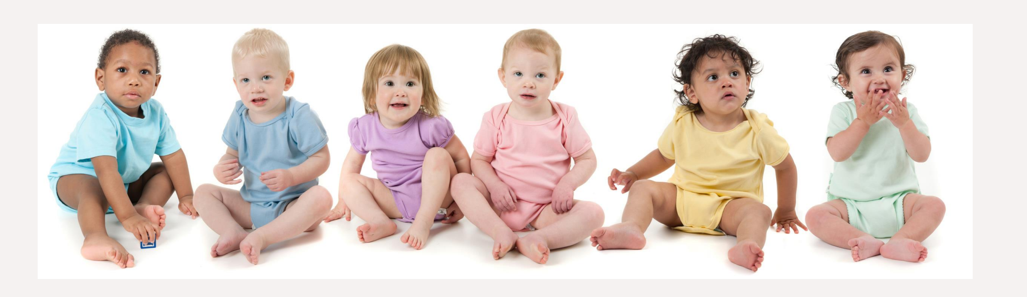
0-5 YEARS OF CRITICAL GROWTH IN THIS DEVELOPMENT STAGE