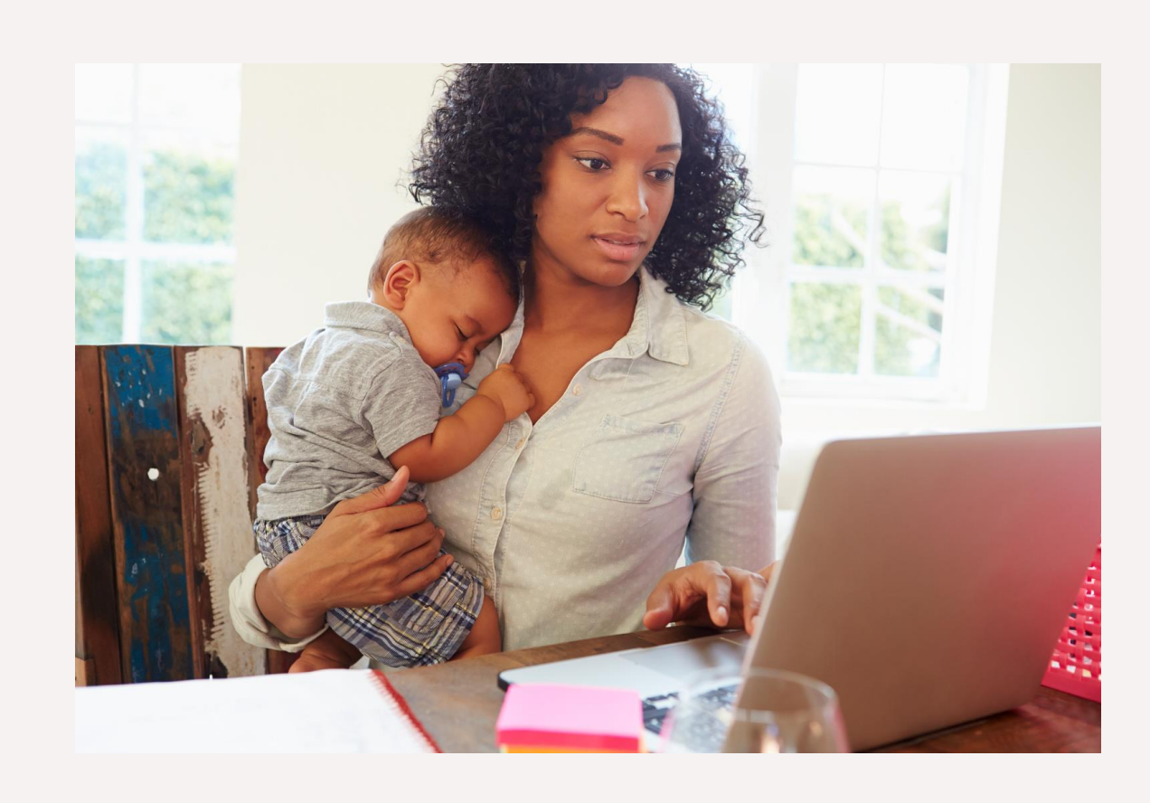
ACCESS TO WORKFORCE