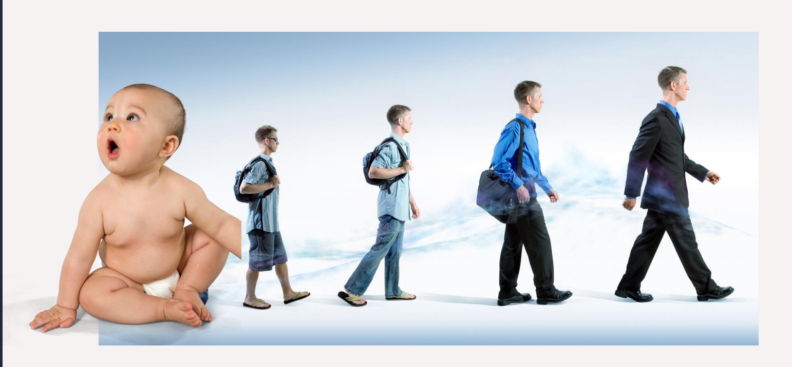
CRADLE TO CAREER