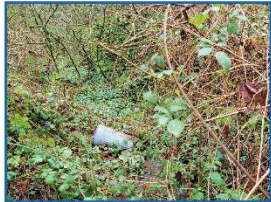
STREAM Y: THE MAIN CHANNEL AND SURROUNDING BUFFER, OVERGROWN WITH ENGLISH IVY AND HIMALAYAN BLACKBERRY.