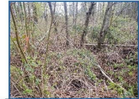
WETLAND C: INCLUDING PORTIONS TO BE FILLED ARE COMPLETELY OVERGROWN WITH HIMALAYAN BLACKBERRY, CHOKING OUT NATIVE VEGETATION.