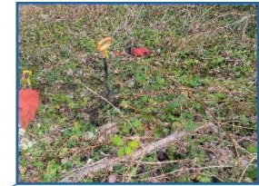
WETLAND D: INCLUDING PORTIONS TO BE FILLED ARE A DENSE CARPET OF ENGLISH IVY AND HIMALAYAN BLACKBERRY.