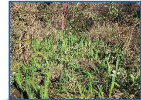
WETLAND A: OVERTAKEN BY INVASIVE IRIS PSEUDOACORUS & HIMALAYAN BLACKBERRY.