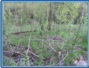
WETLAND RESTORATION PROJECT: AFTER 2 YEARS OF GROWTH