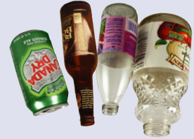
Empty & clean cans & glass bottles