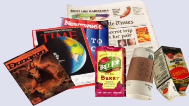
Mixed paper, empty cartons, & paper coffee cups