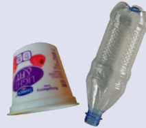
Empty & clean plastic containers, tubs, & jugs