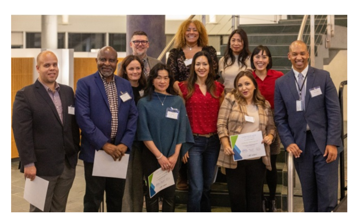
2024 Year-End Celebration and Business Accelerator Graduation at Pier 69

On December 11th, we closed 2024 with a bang by holding our Year-End Celebration & Business Accelerator Graduation! With nearly 200 people present for the event, attendees got insight on highly anticipated 2025 projects and solicitations, heard from Port leadership, networked with the many small business owners, organizations, and agencies in the room, and celebrated the Business Accelerator Mentorship Program graduates!