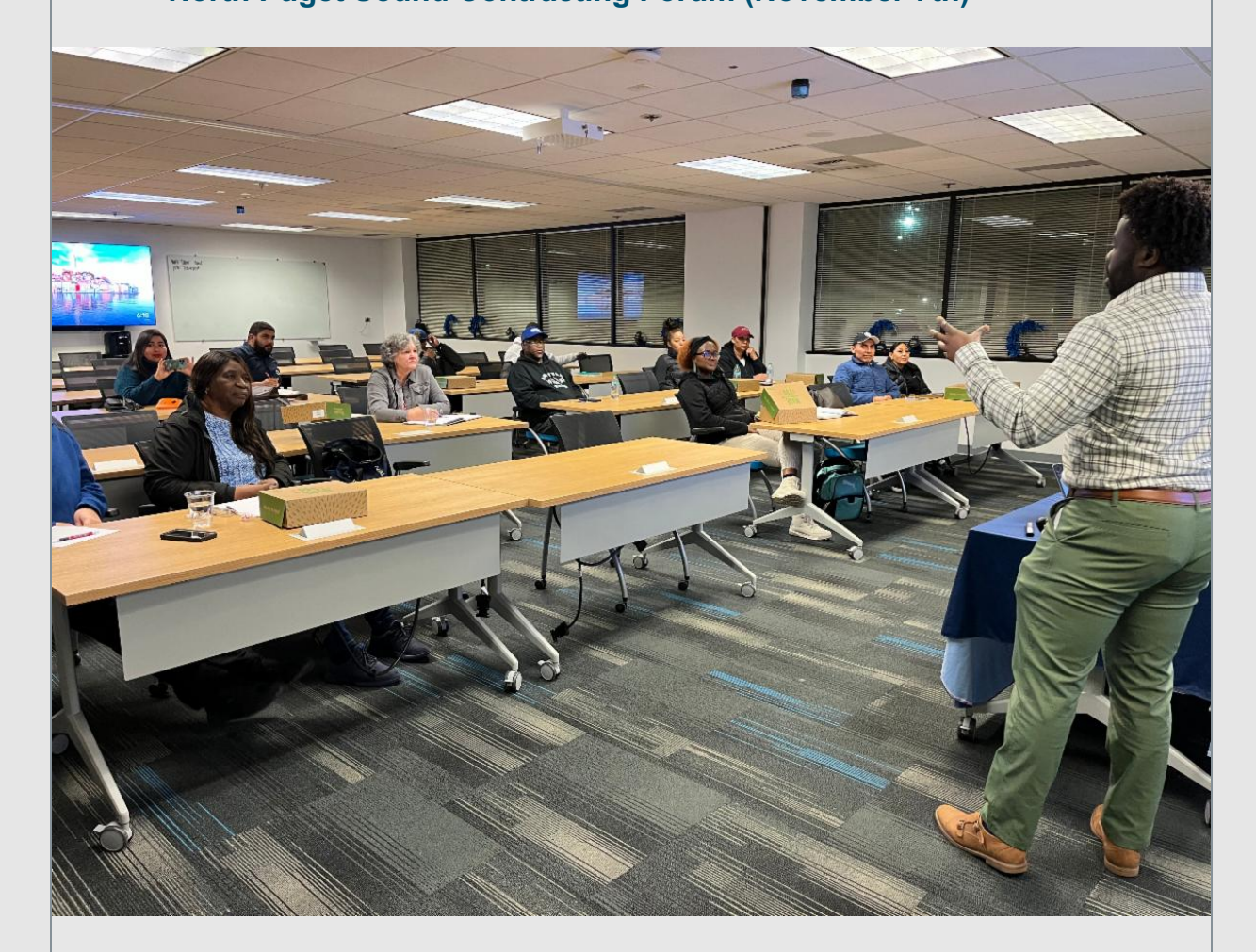
Attendees came ready to understand how to do business with the Port!

• North Puget Sound Contracting Forum (November 7th)