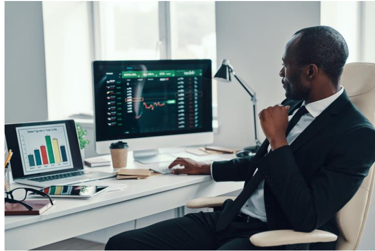
Lightcast & Labor Market Data