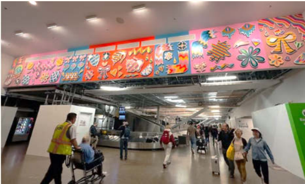
Raindrops on Roses