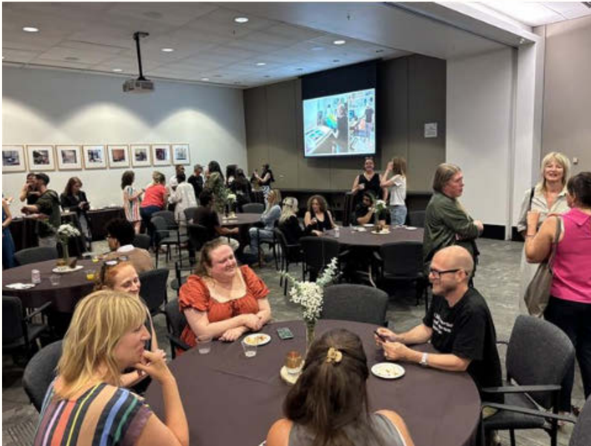
Art Reception guests enjoying canapés and conversation