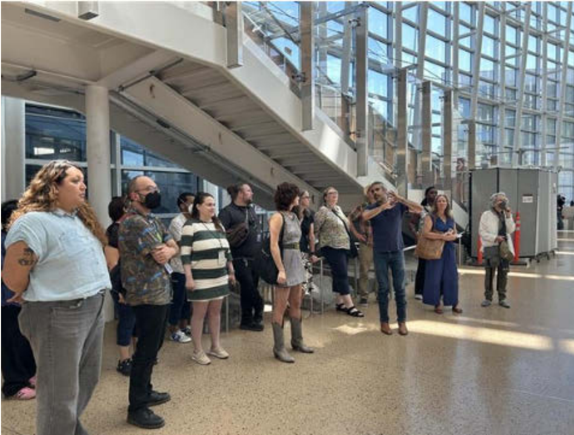
ARTS-PACC King County Tour