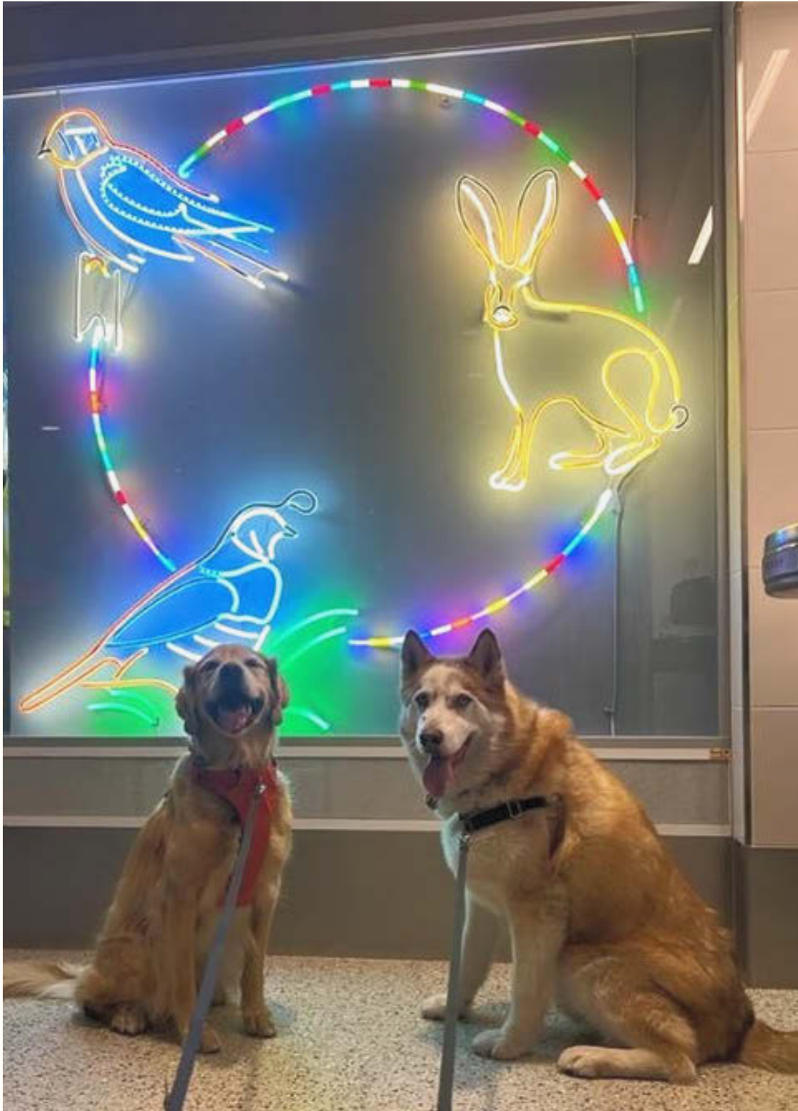
Two furry friends celebrating the new neon pieces