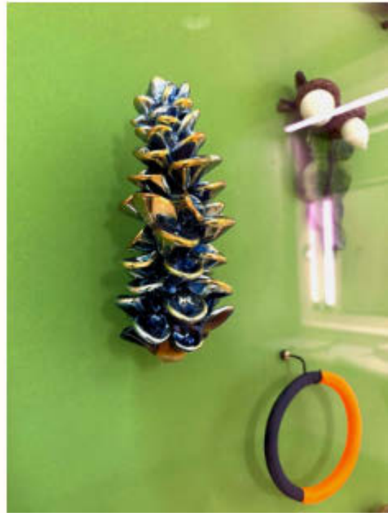
Illuminating the Palouse - Nursing Suite