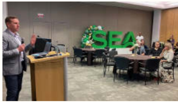
Remarks from Commissioner Calkins