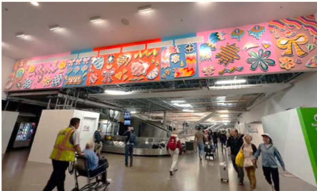
Raindrops on Roses